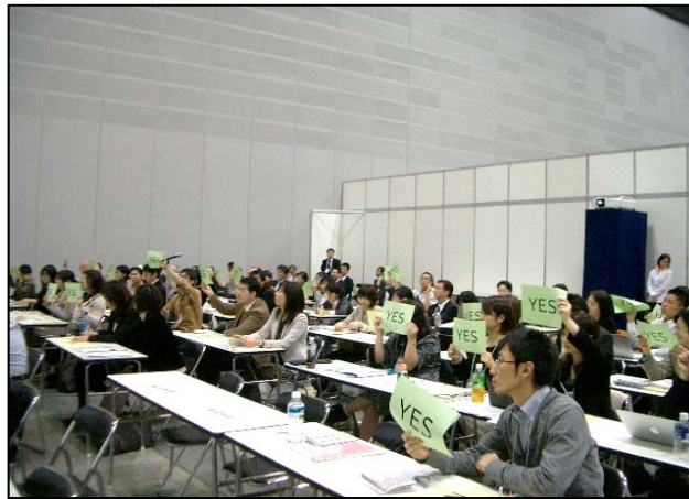
全国ワークショップDRF8 (2011), DRF 9(2012)