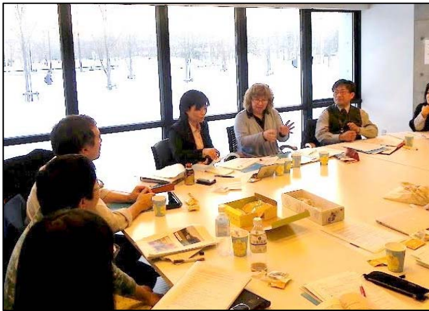
英国リポジトリサポートプロジェクト (RSP) との対話