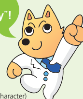
Bit (NII Character)