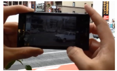
Figure 2 “Memory Hunting”, a smartphone app that enables users to take a photograph at the same location and same angle as a previously taken photograph.

Carrying out research across disciplines is not easy, because both sides have to take a completely new approach to their research. However, unless disciplines are