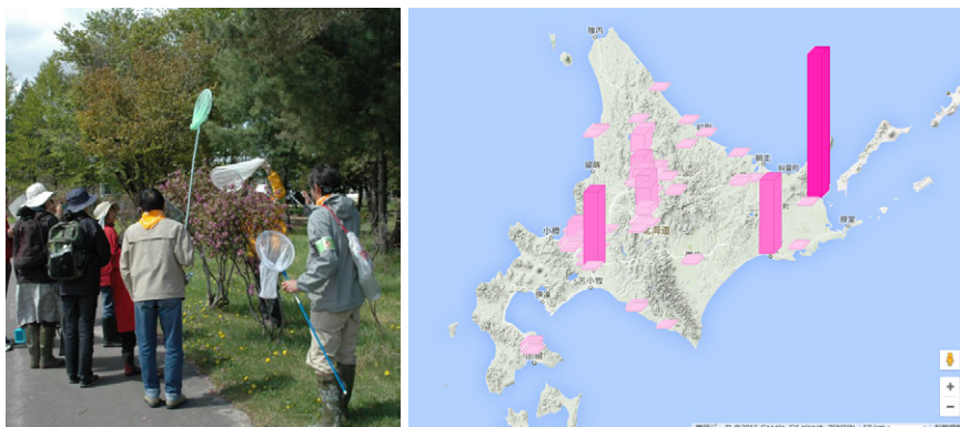
Figure1 “Seiyou Status”, a citizen-based monitoring project to control an invasive species.

The “Seiyou Status” project to control an invasive species in Hokkaido is a typical cit-