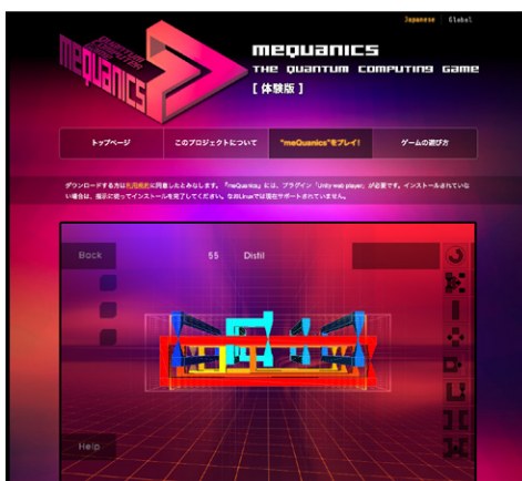
Figure Screenshot of the meQuanics game

When quantum circuits are translated into these 3D puzzles, they are unnecessary